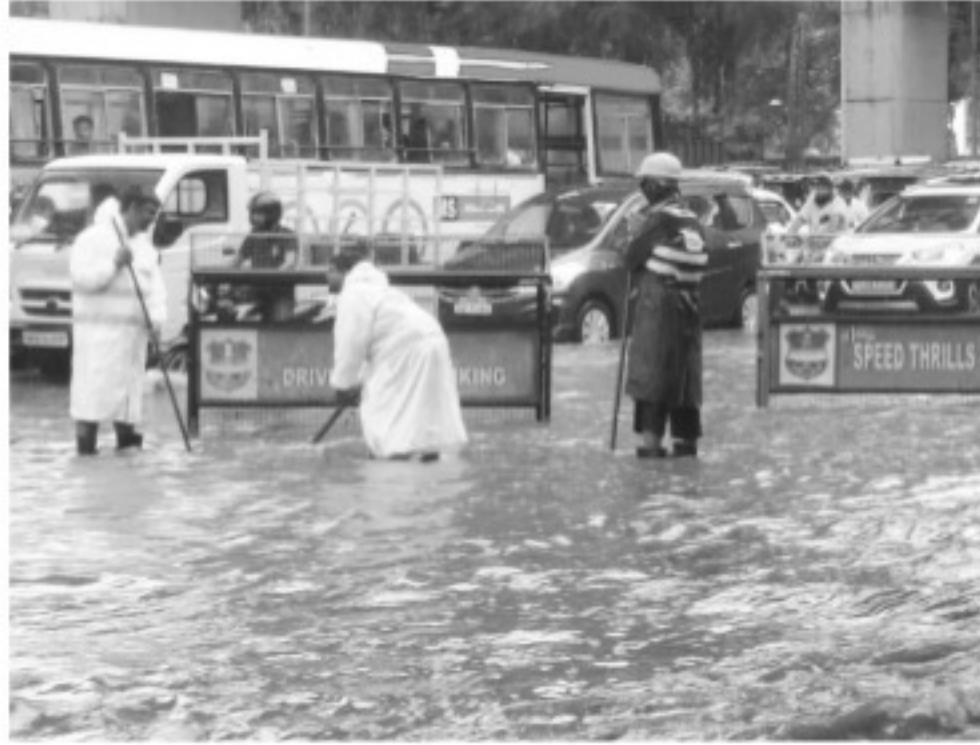
అక్సెస్ వర్షం హైదరాబాద్ నగరంలో మంగళవారం కులసిన అక్సెస్ వర్షానికి రహదారులపై మోకాలులేతు వరద నిలిచిపోయింది.