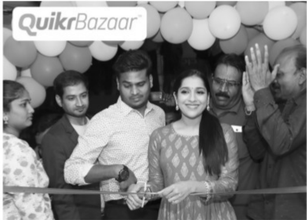
నిర్మలతో క్విక్ బజార్.. పాత ఉత్పత్తులను కొనుగోలు, విత్తాయిచదాచి వీలుగా క్విక్ బజార్ లోని నిర్మలతో తన వదన క్విక్ బజార్ ను ఏర్పాటు చేసింది.